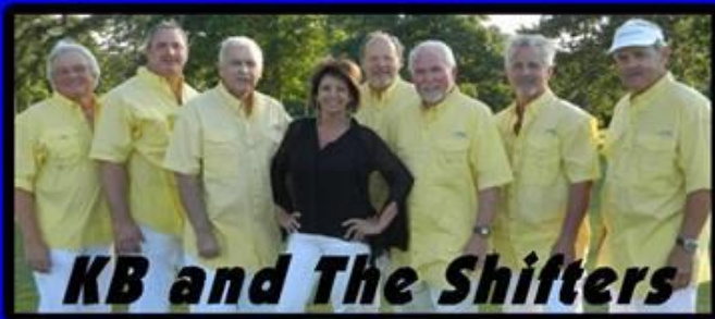
KB and The Shifters