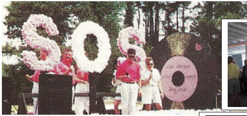
LNSC's first parade float.