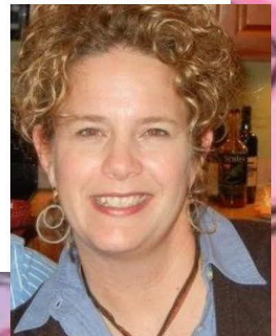
2024 Chicken Pickin' Committee Board Member

A handwritten signature in black ink, appearing to read 'Staggins'.