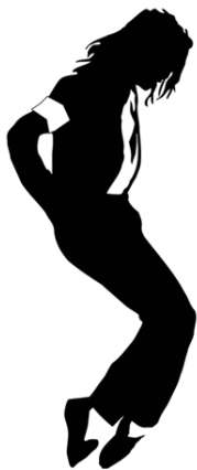
The Way You Make Me Feel - Michael Jackson - 1988

Also, we hope everyone is excited about our Saturday night 80's dress up night. We want to relive the 80's by bringing back (through 80s styles, celebrity look alike costumes, etc..) the decade that Lake Norman Shag Club was established.